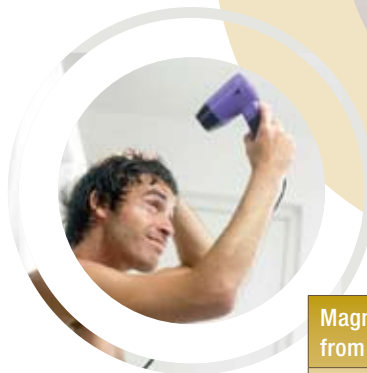
Magnetic Field at Various Distances from the Source* (mG)