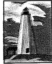
The vision of New Haven's children is our city's greatest resource*