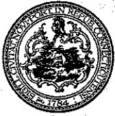
JOHN DESTEFANO, JR. Mayor

165 CHURCH STREET • NEW HAVEN • CONNECTICUT 06510